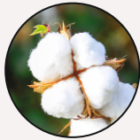
Ginners / Spinners